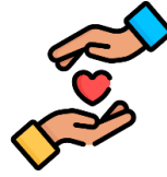
Pre-Existing Conditions Accepted