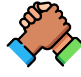
Resident & Non-Residents