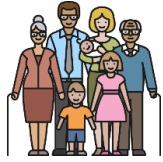
Add Your Whole Family, Parents & In-Laws

Inzuria Health basic plans were designed for Residents and Non-Residents in mind. You can access health plans that fit your needs starting from $29/month for the Telemeda plans for individuals and sole proprietors, to MEC plans starting at $91. These plans offer you access to telemedicine, visits with Board Certified physicians/specialists, hospitals, pharmacy discounts, and more.